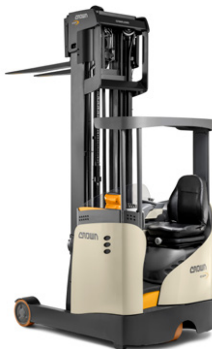
ESR 1200 Series

Discover how the ESR 1200 Series reach truck can boost your throughput: